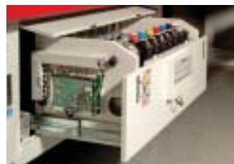
Ink control tray