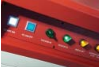
Easy to use operator panel