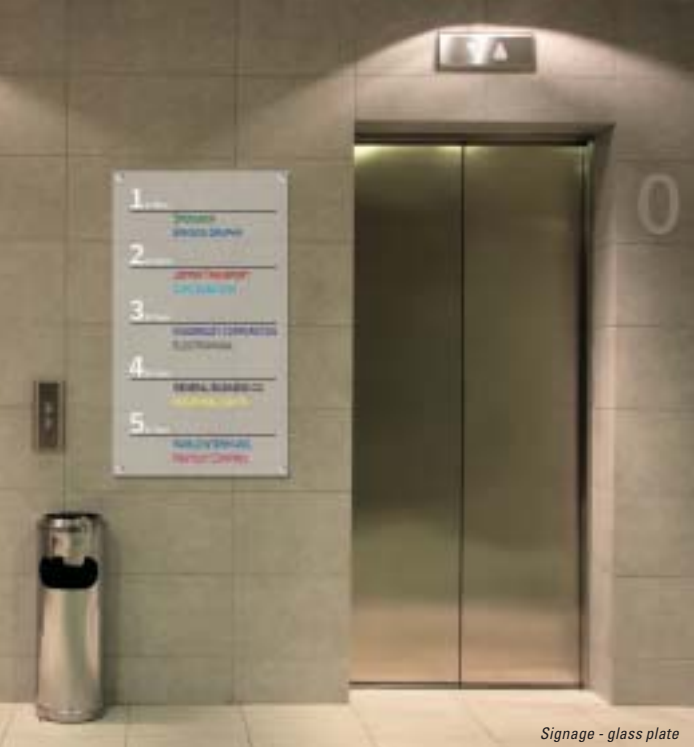
Signage - glass plate