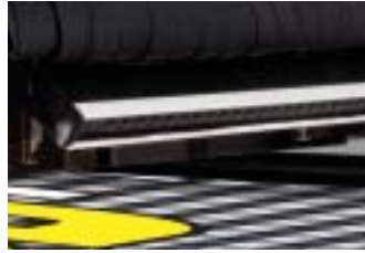
Shuttle safety sensors