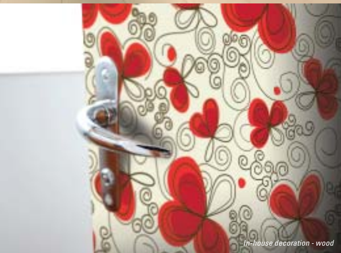
In-house decoration - wood