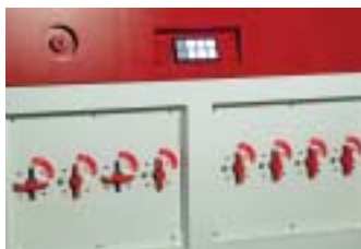
Switches to activate either of the 8 vacuum compartments